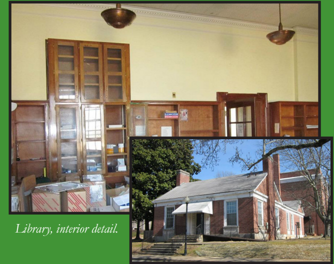
Library, interior detail.

The old City Library has been abandoned since the 1990's. This lovely and historic structure bears a brass plaque attesting to its 1939 construction as part of President Franklin D. Roosevelt's Federal Emergency Administration of Public Works (FEAPW).